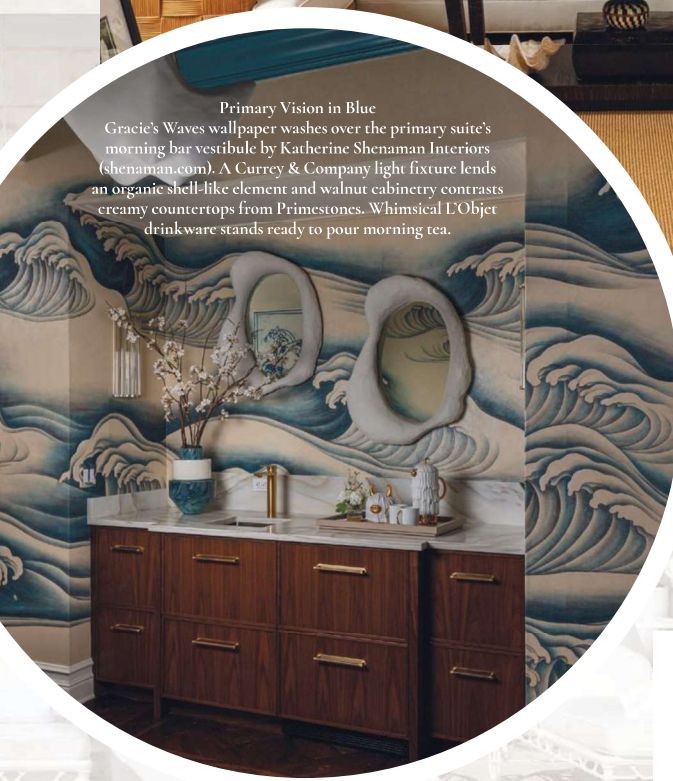
Primary Vision in Blue Gracie's Waves wallpaper washes over the primary suite's morning bar vestibule by Katherine Shenaman Interiors (shenaman.com). A Currey & Company light fixture lends an organic shell-like element and walnut cabinetry contrasts creamy countertops from Primestones. Whimsical L'Objet drinkware stands ready to pour morning tea.